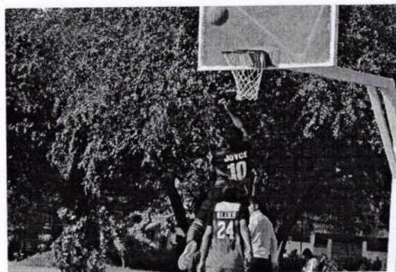
Students participating in basketball match