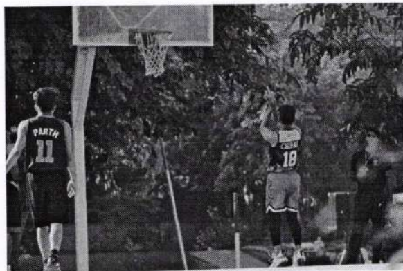
Students participating in basketball match