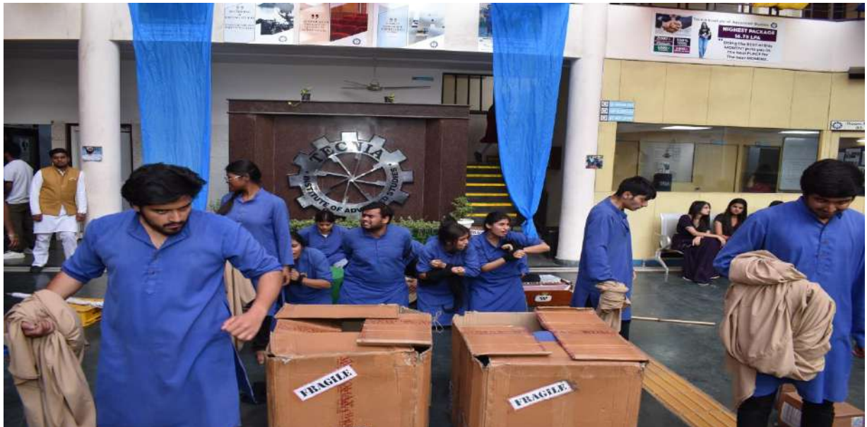
Photograph of the Event