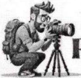
Photo Feature Contest