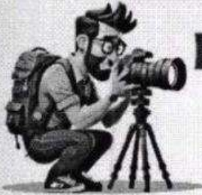
Photo Feature Contest