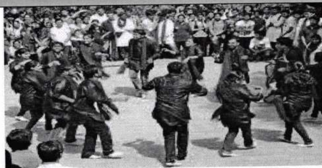
Students presenting Nukkad Natak on the theme " One Man, One Vote"

Coordinator Internal Quality Assessment Cell (IQAC) Tecnia Institute of Advanced Studies New Delhi-110085