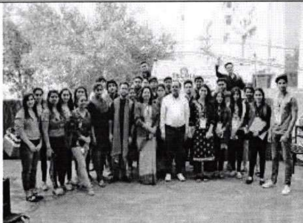
Students and Faculty members ready to explain the registration process on online voting app

Report: Description in (min 250 to max 800 words)*