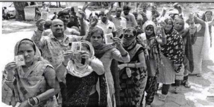
Residents showcasing their voter ID cards