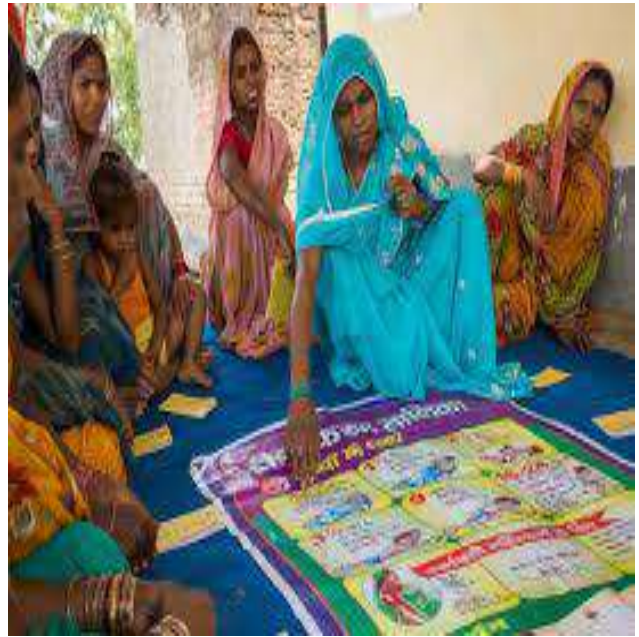
"A rural women's group engaging in a community education session to enhance awareness and empowerment."