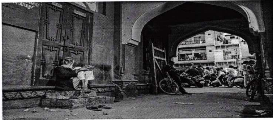
Quiet contemplation amidst bustling urban life, framed in contrast.