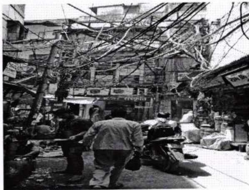
Chaotic urban alleyway filled with tangled wires and movement.

Report: Description in (min 250 to max 800 words)*