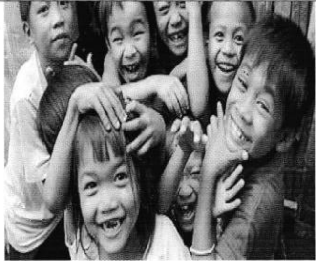
Fruitful Smiles: Sowing Seeds of Health and Happiness in Every Home

Report: Description in (min 250 to max 800 words)*