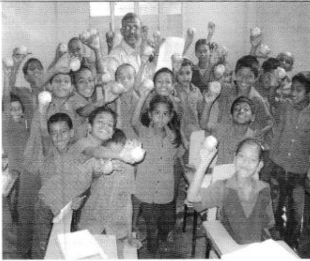
Happiness Grows Where Communities Nourish Each Other