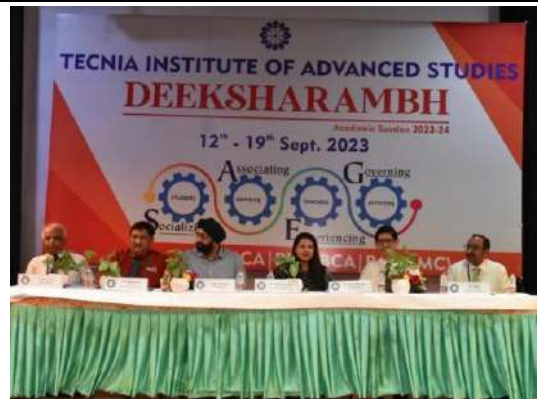
Dignities on DIAS during immigration