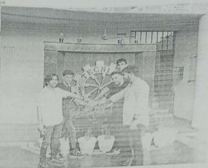
Caption: Participants taking oath for being committed towards environment safety.