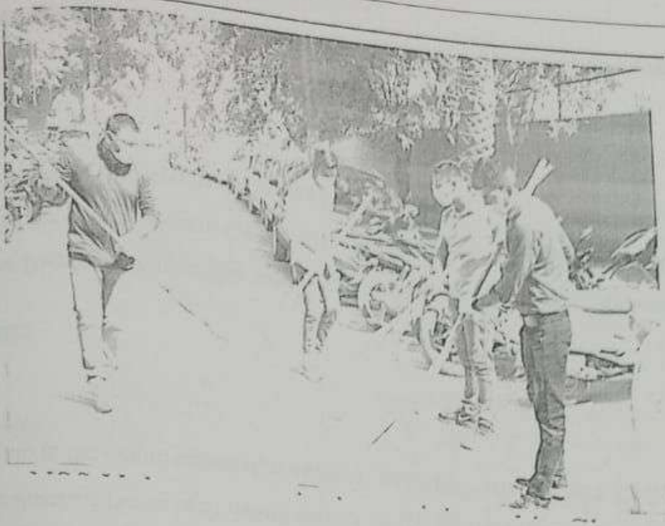
Caption: Volunteers Participating in Cleanliness Drive