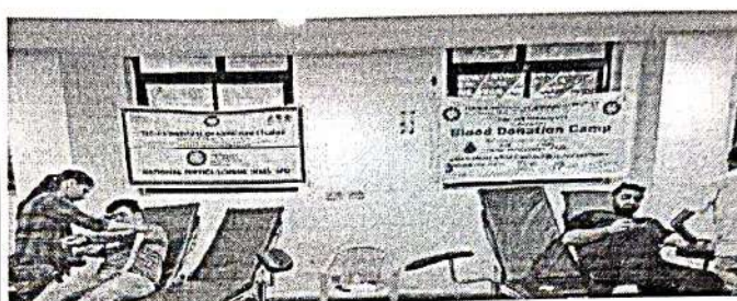
Student from other college, participating in Blood Donation