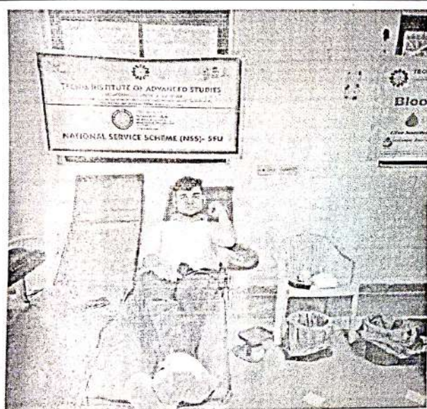
Students of Tecnia Donating Blood