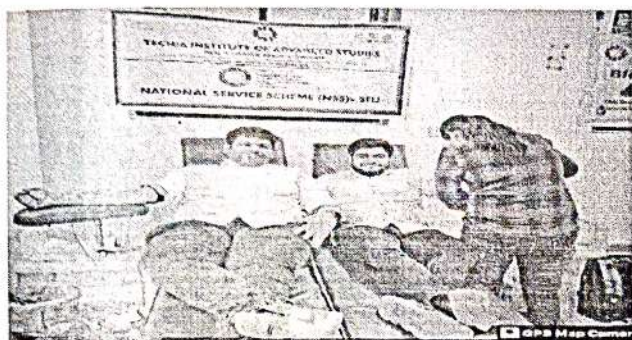
Students of Tecnia at Receptions Desk