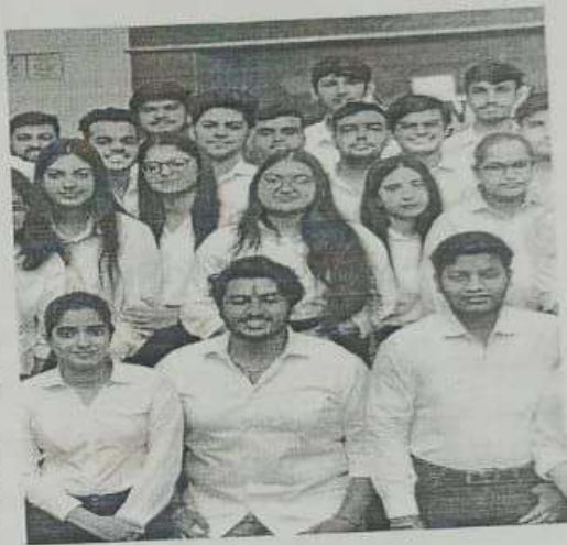
Caption: Participants took anti-terrorism Pledge

"We, the people of India, having abiding faith in our country's tradition of non-violence and tolerance, hereby solemnly affirm to oppose with our strength, all forms of terrorism and violence. We pledge to uphold and promote peace, social harmony, and understand among all fellow human beings and fight the forces of disruption threatening human lives and values."