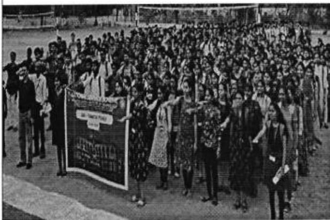
Pledges to say no to tobacco