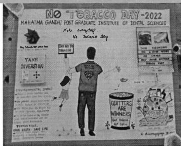
Poster on No Tobacco Day

Coordinator Internal Quality Assessment Cell (IQAC) Tecnia Institute of Advanced Studies New Delhi-110085