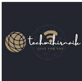
WhatsApp Image 2021-06-19 at 6.39.55 PM.jpg 88K