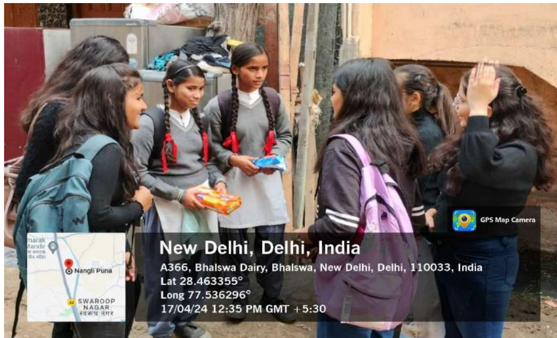
TIAS students interact with community girls for a sanitation initiative

The Menstrual Cup Workshop was organized in a remote area to educate young girls about menstrual health and hygiene. This initiative aimed to provide them with an alternative menstrual product that is both eco-friendly and cost-effective. The workshop was attended by 50 girls aged between 12 and 18 years.