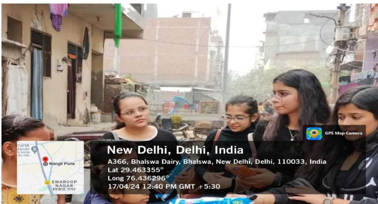
Participants educate girls on menstrual health