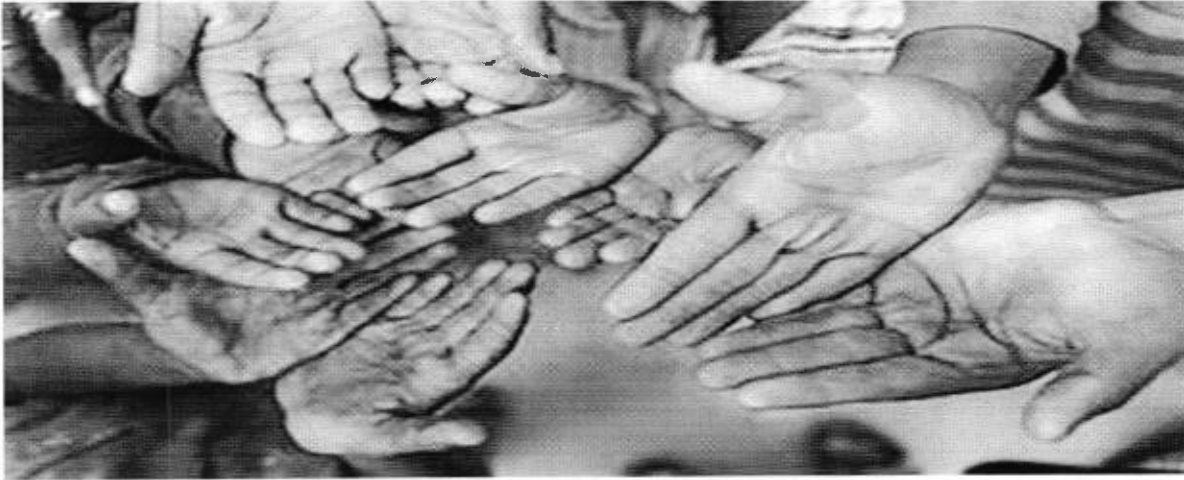
Together We Thrive: Celebrating the Power of Love, Unity, and Belonging

Report: Description in (min 250 to max 800 words)*