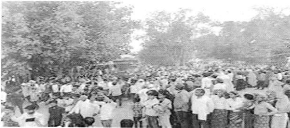
Building Bonds, Spreading Joy: From Individuals to a Stronger Collective