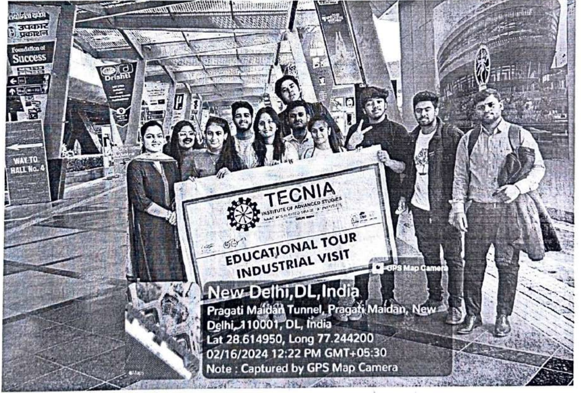
BA(JMC) students at World Book Fair, Pragati Maidan