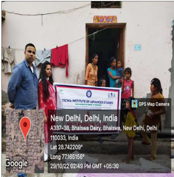
Students interacting with the house holder for Dengue Awareness