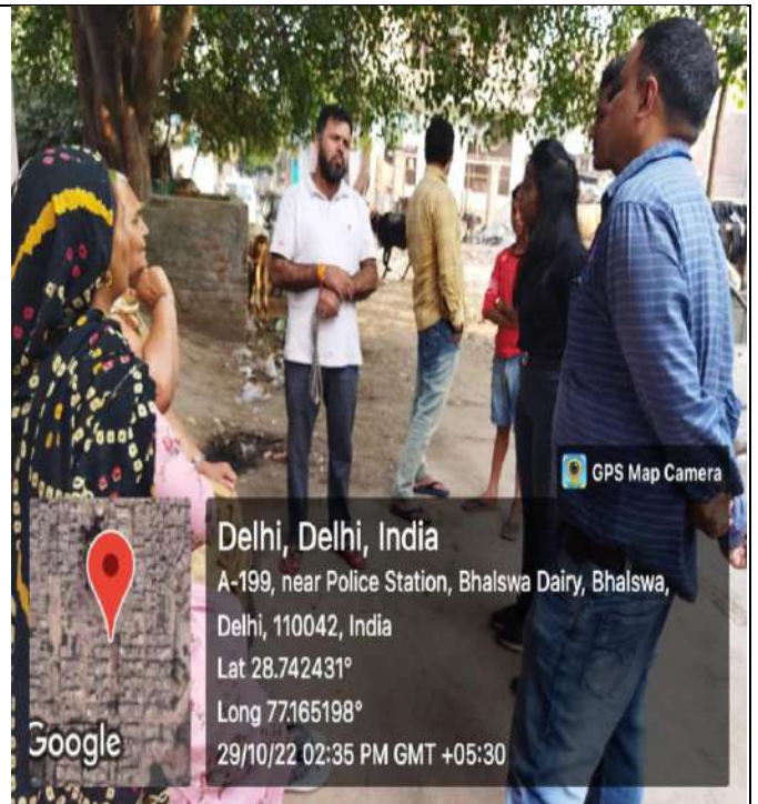
Students interacting with the Villagers for Dengue Awareness