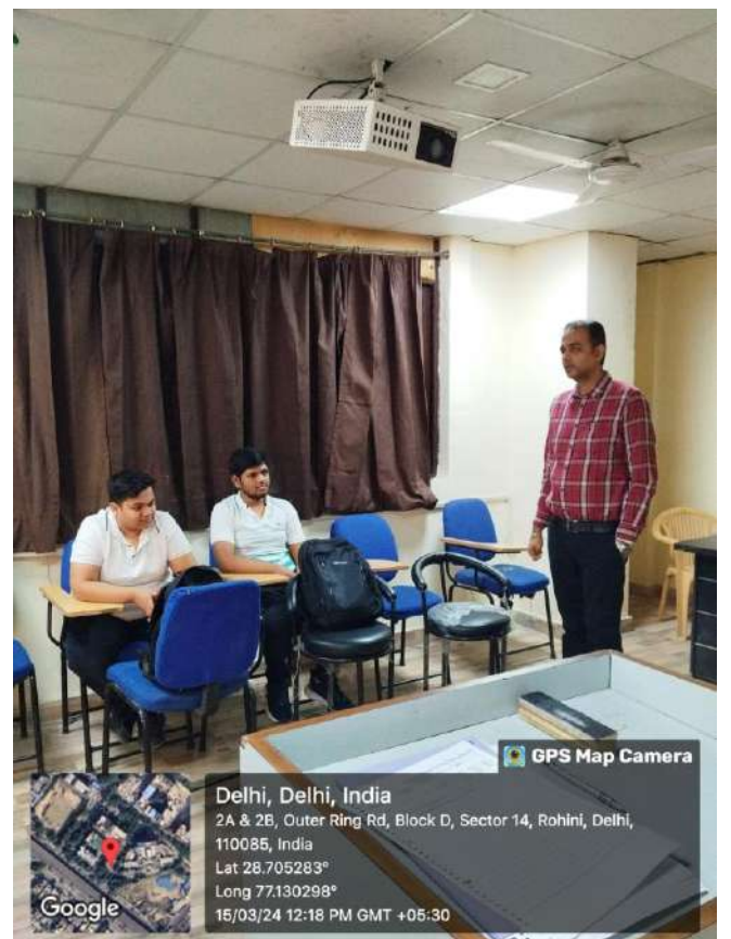
Photograph of the Event with the Caption