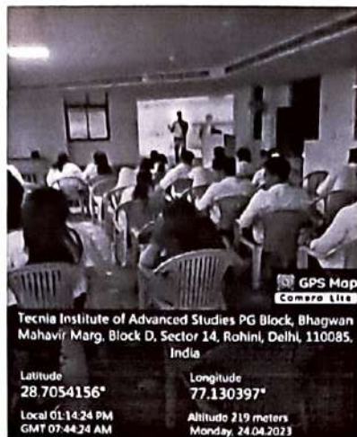
Photograph of the Event with the Caption