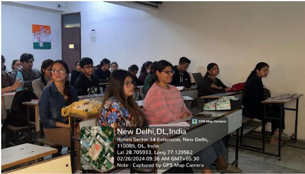
Students engaging in interactive mock interview session