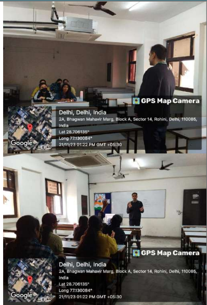
Photograph of the Event with the Caption