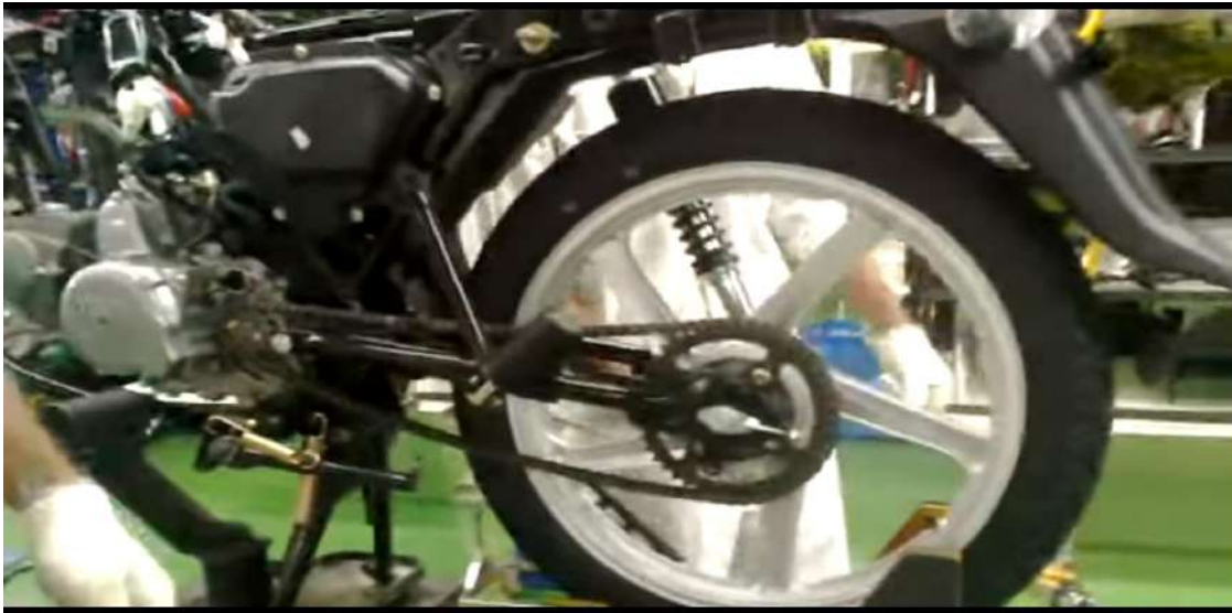
Processing of Motor Cycle at Hero Motor Plant

Hero Honda brand is united and every motorcycle is trustily developed by each worker to ensure safety and loyalty towards the company.