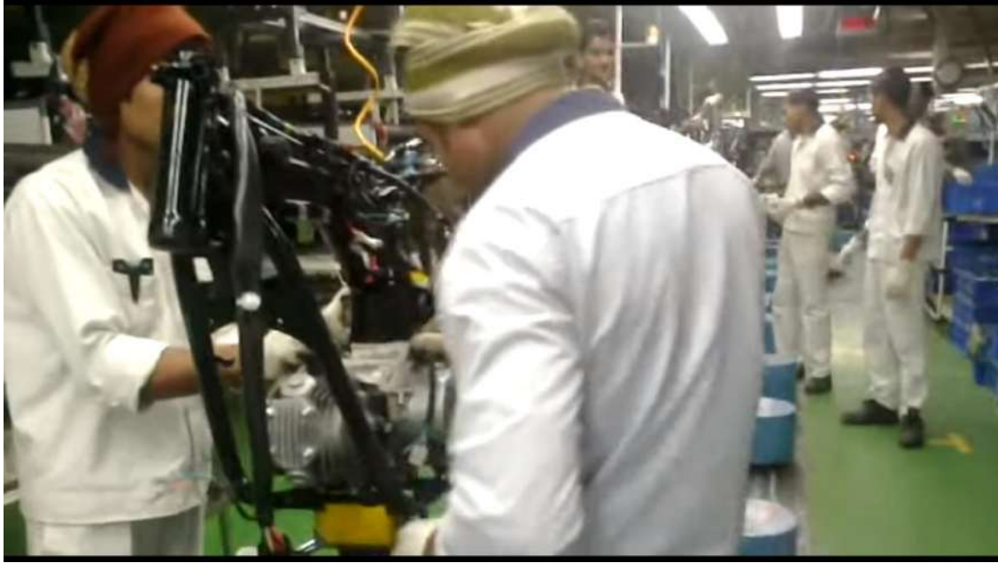
Manufacturing process of Hero Motor Limited