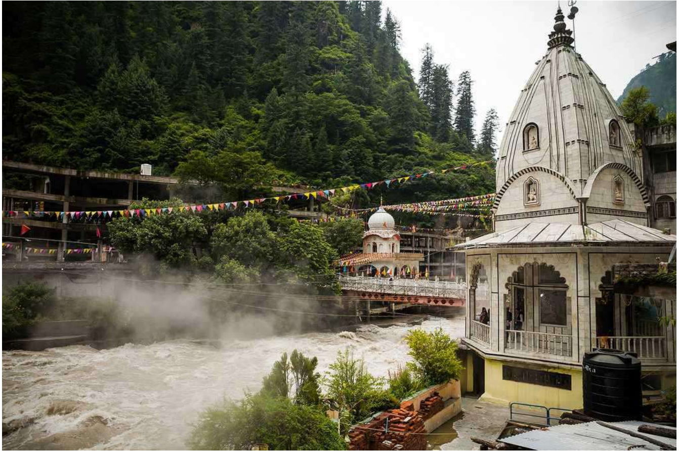
Students visit Manikaran Sahib Gurudwara