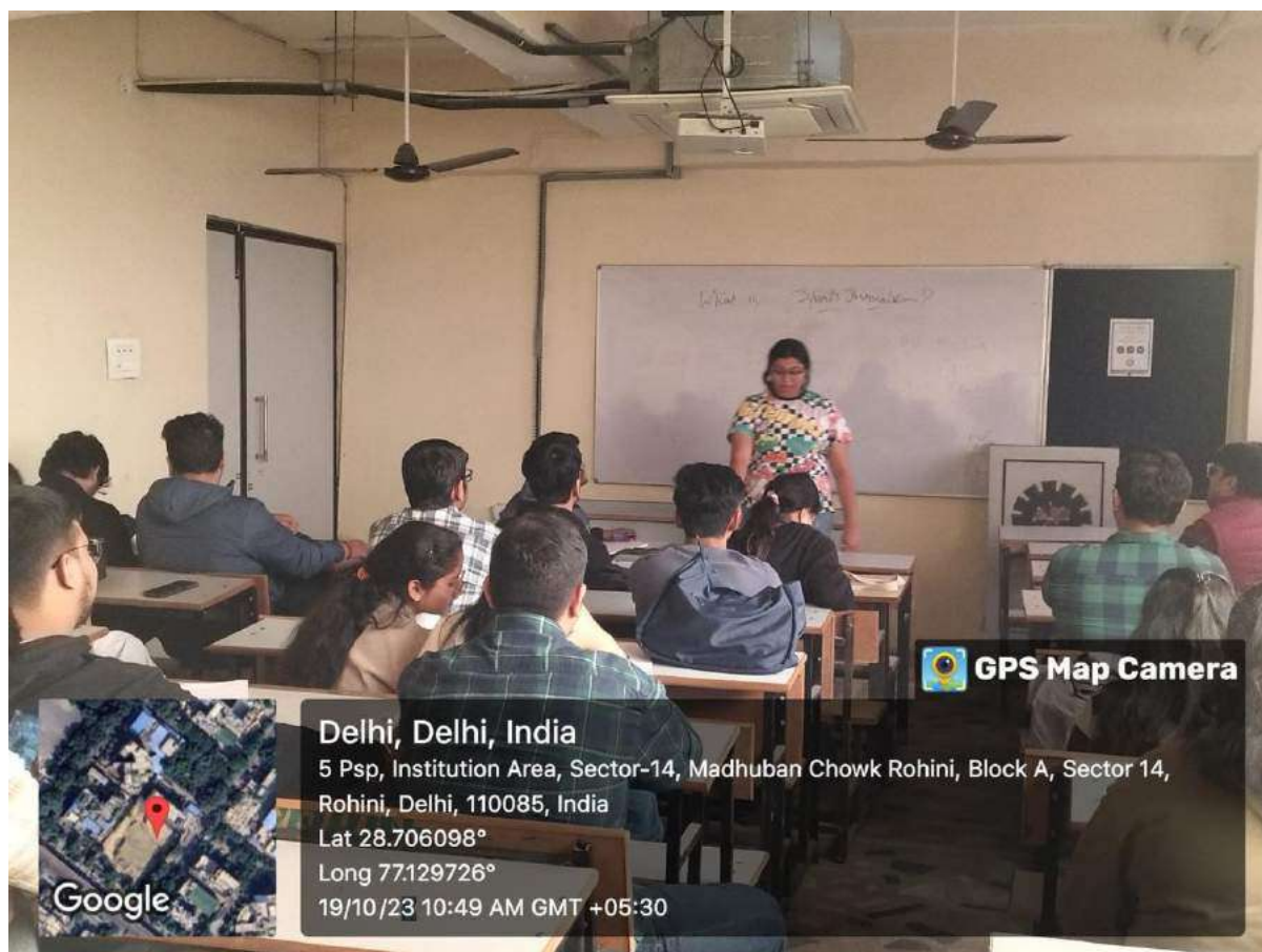
Students discussing on the topic as provided by the supervisor.