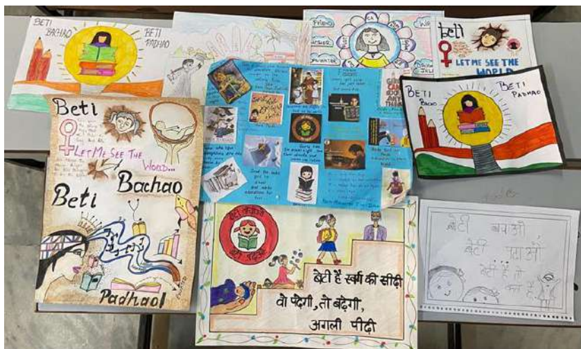
Posters designed by participants.