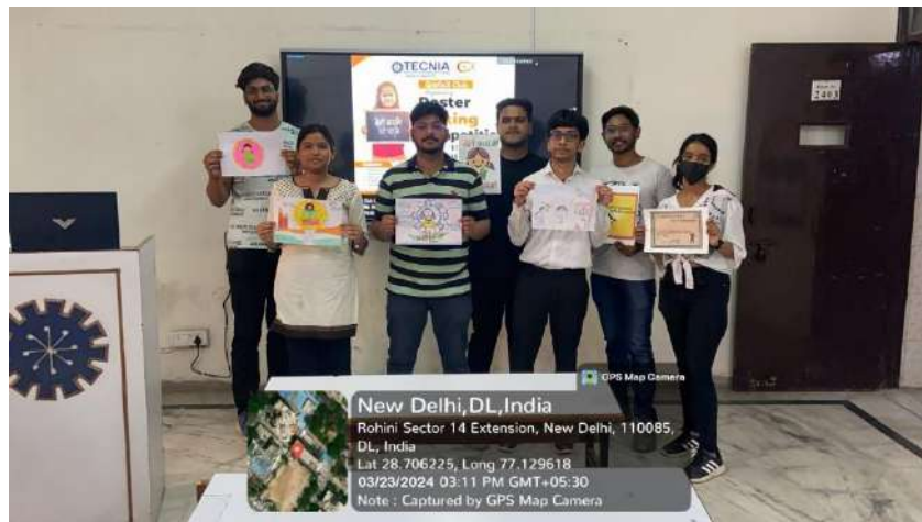
Participants of Poster Making Competition with their posters.