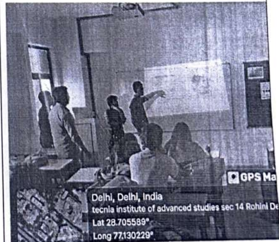
Students engaging in interactive session amongst themselves