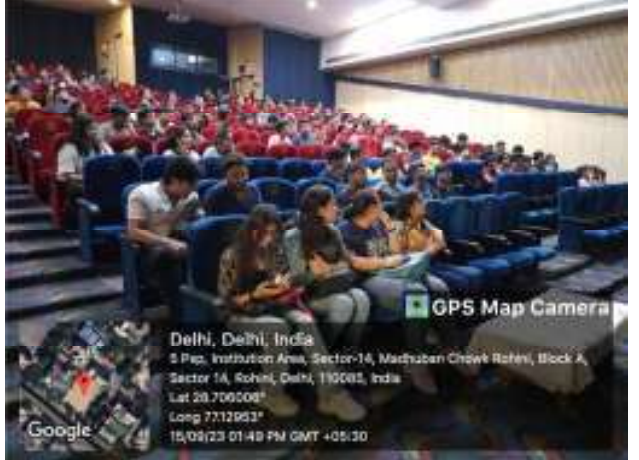
Students noted important points to have an effective communications.