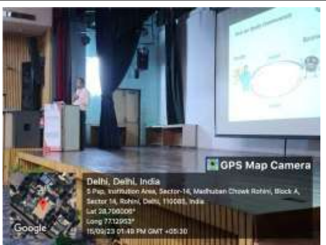
The resource person delivered the importance of communication skills.

Photograph of the Event with the Caption