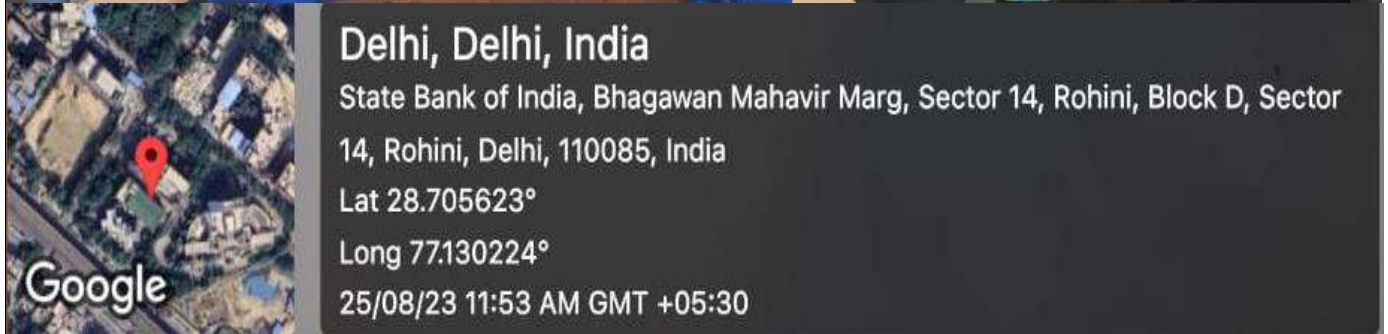
Students showcasing their creative work on Girl 0000 Child