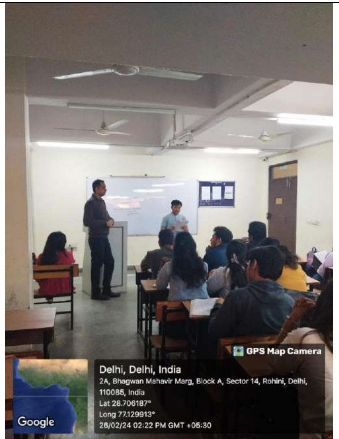
Photograph of the Event with the Caption