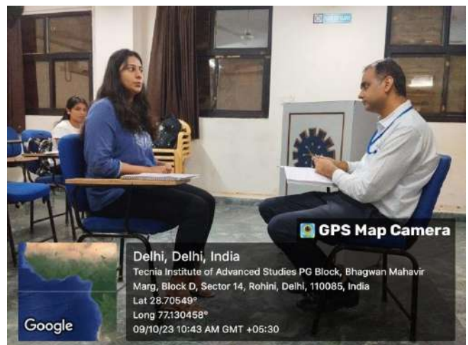
The resource person conducted Mock Interview session with the students

Report: Description in (min 250 to max 800 words)*