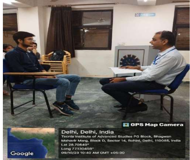
The resource person conducted Mock Interview session with the students.