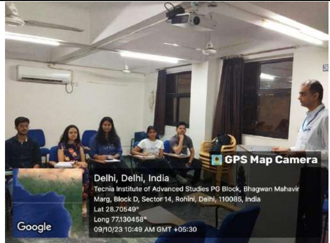
The speaker informed the students on key pointers for Interview Skills

Photograph of the Event with the Caption