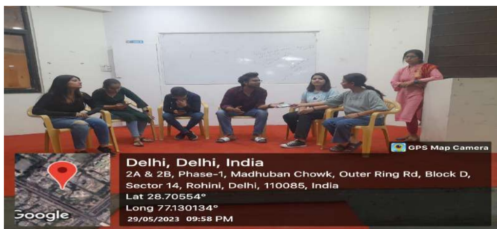
Students participating in the GD