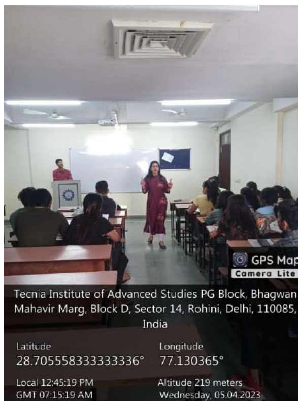
Resource person sharing the feedback