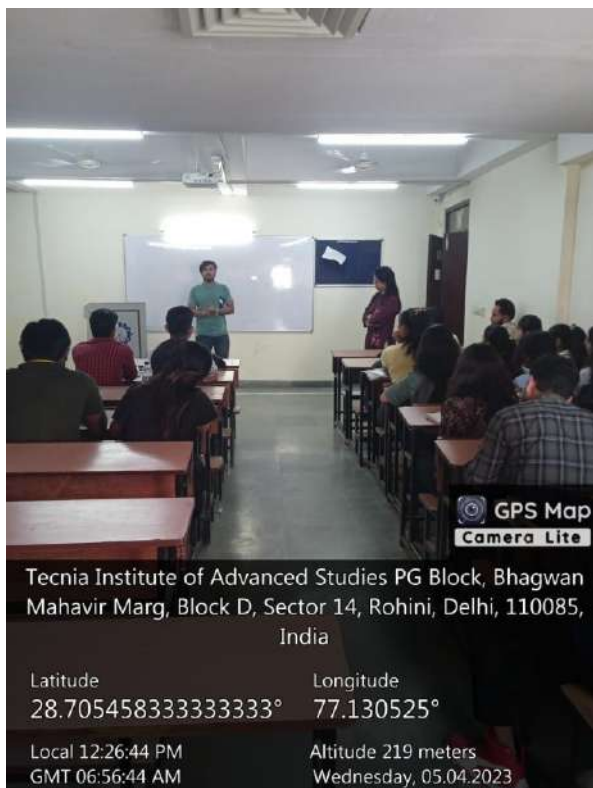
Students participating in the session