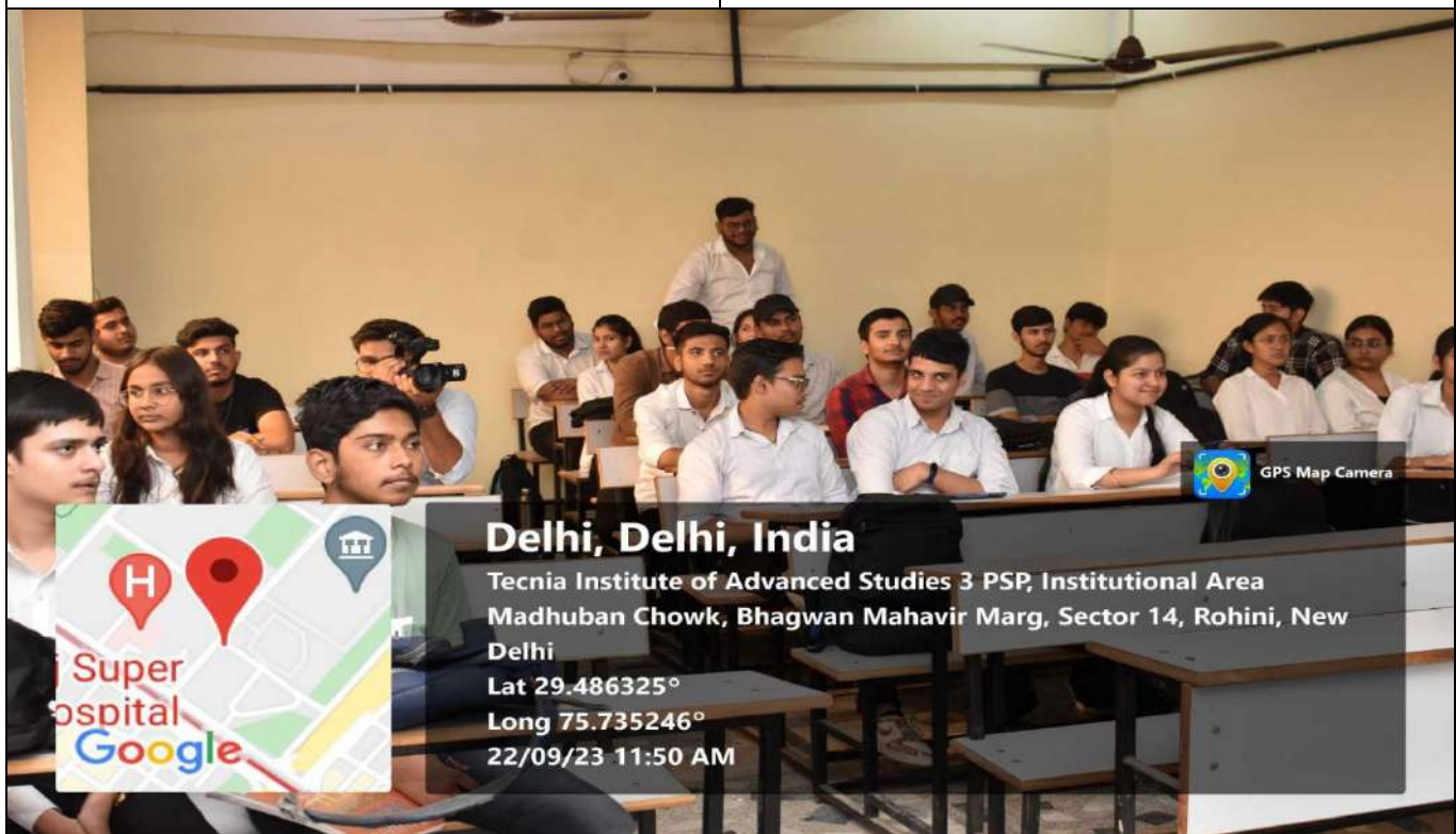
Students Participating in the workshop