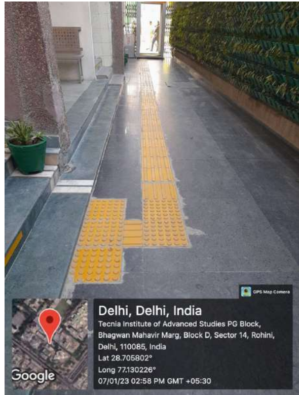
Facilities for Blind Person