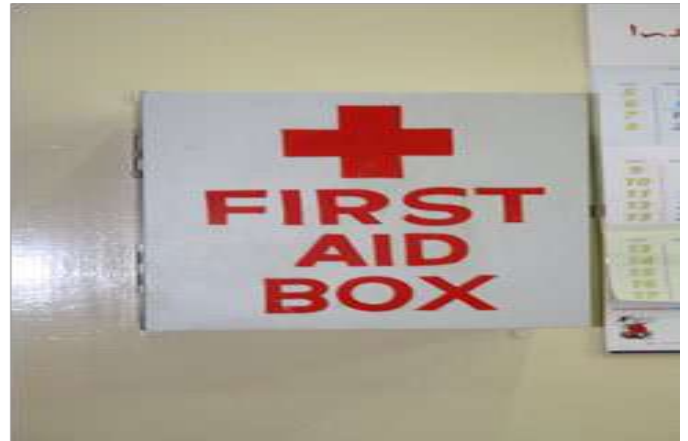
First Aid Box