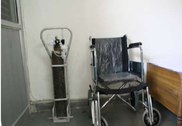
Oxygen Cylinder with Stand & Wheel chair

On Campus Medical facility Available for minor Ailments. However Hospital is available within 50 mts.