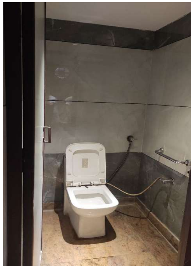
Disabled friendly toilet