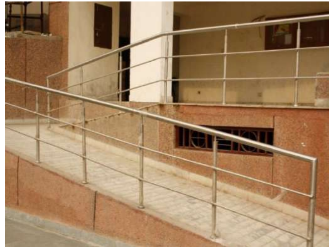
Barrier Facilities and ramp are available