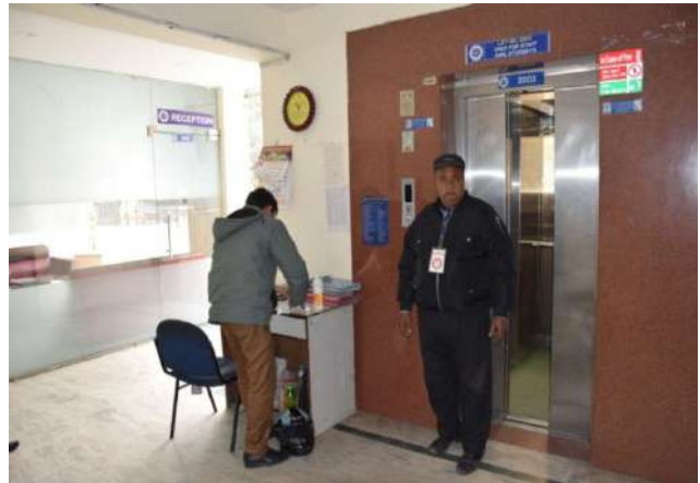
Lift facilities for Staff