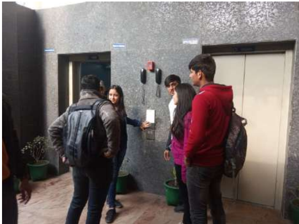
Lift facilities for student