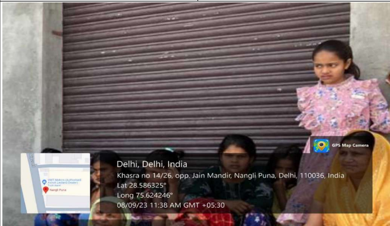
Students make community members understanding about gender diversity and roles