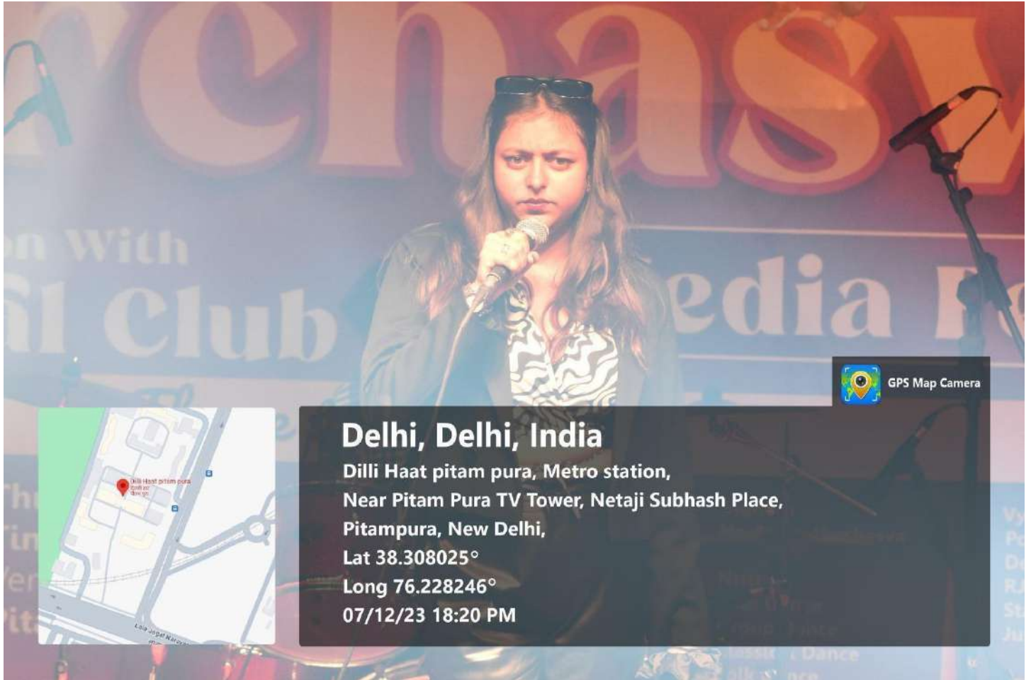
Performance of winner

Nodal Officer, Electoral Literacy Club Sachin Institute of Advanced Studies Madhuban Chowk, Rohini, Delhi -86