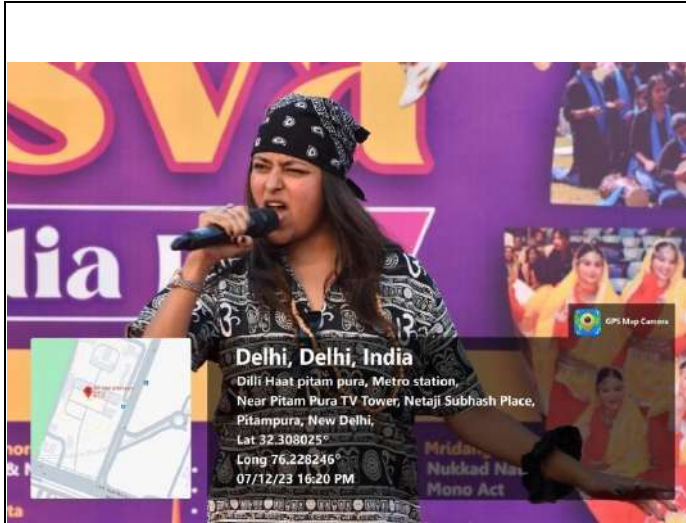
BJMC students performance