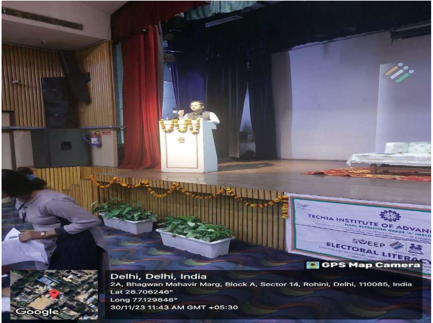
Chief Guest Addressing The students