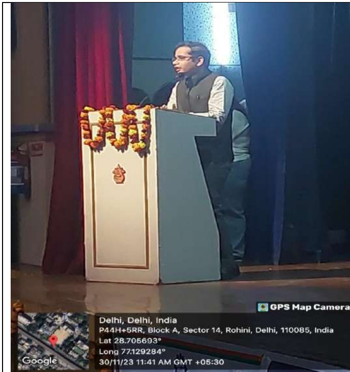
Speech By Chief Guest Awareness among Students for their voting rights (BBA Dept.)