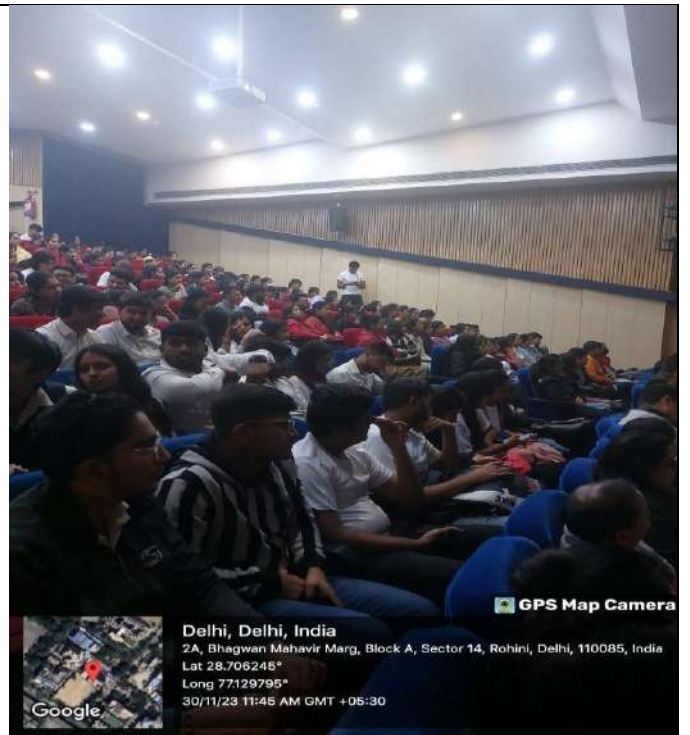
Participants Are listening speech.