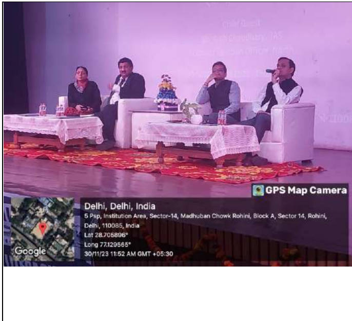
Chief Guest of the Event