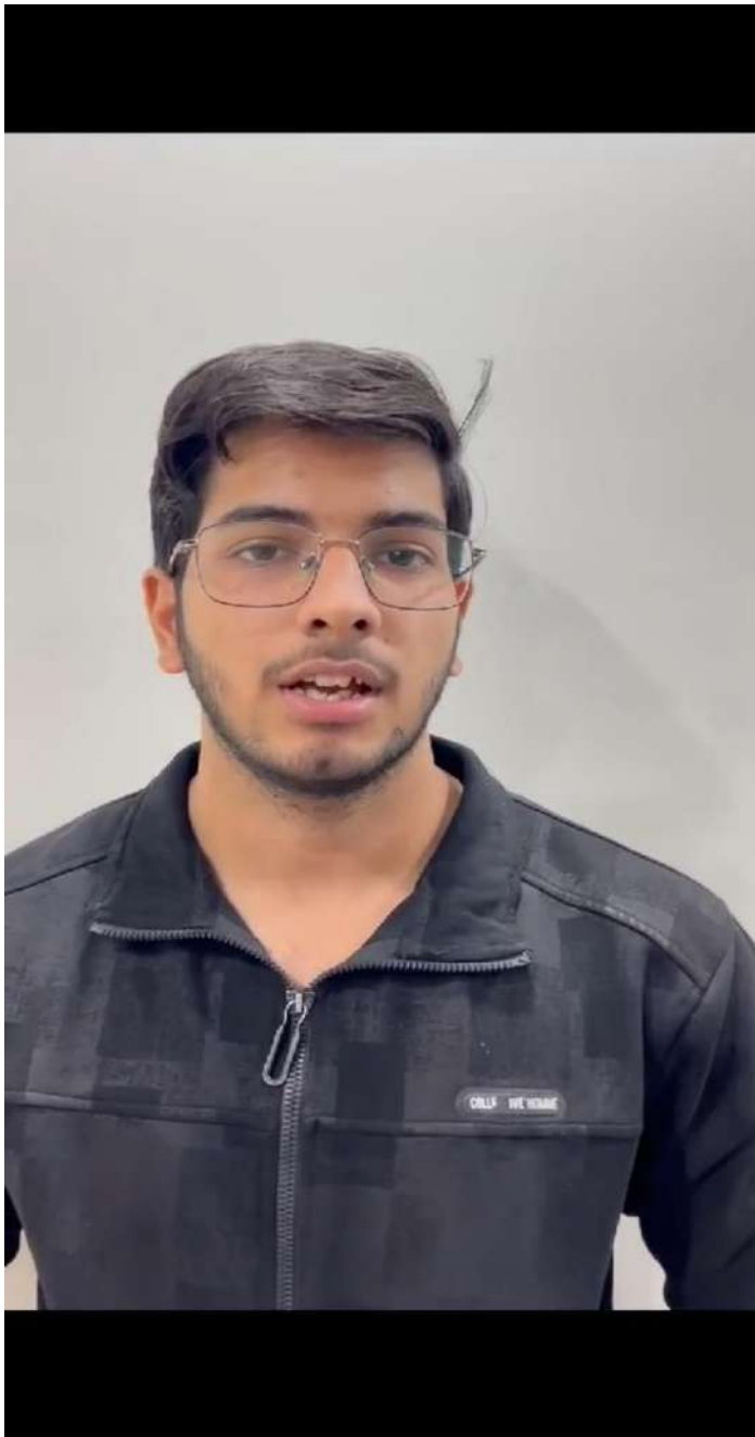
Participant video screenshot

A handwritten signature in black ink, appearing to read "Chakraborty". The signature is fluid and cursive, with a long horizontal stroke extending to the right.