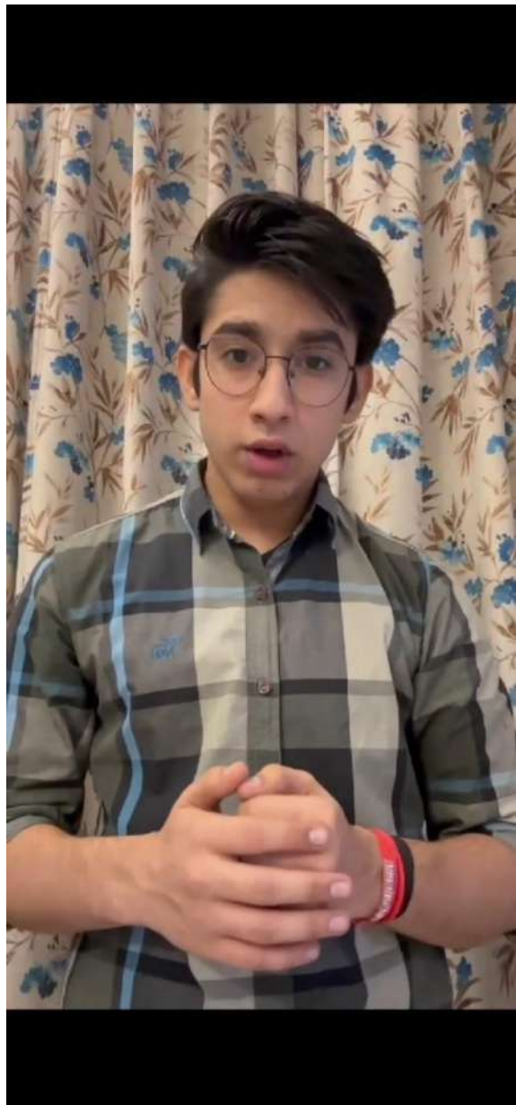
Screenshots Of speech videos of competitors