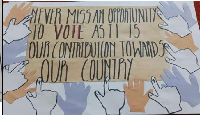
participants poster images