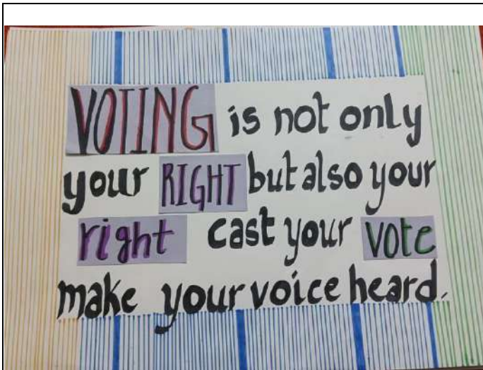
1 st prize winner poster.