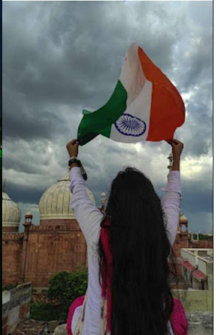
Indian Democracy through the Eyes of Camera