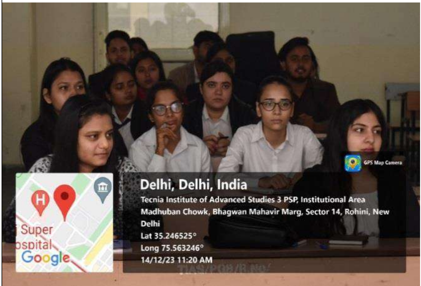
Students are understanding the Scenario