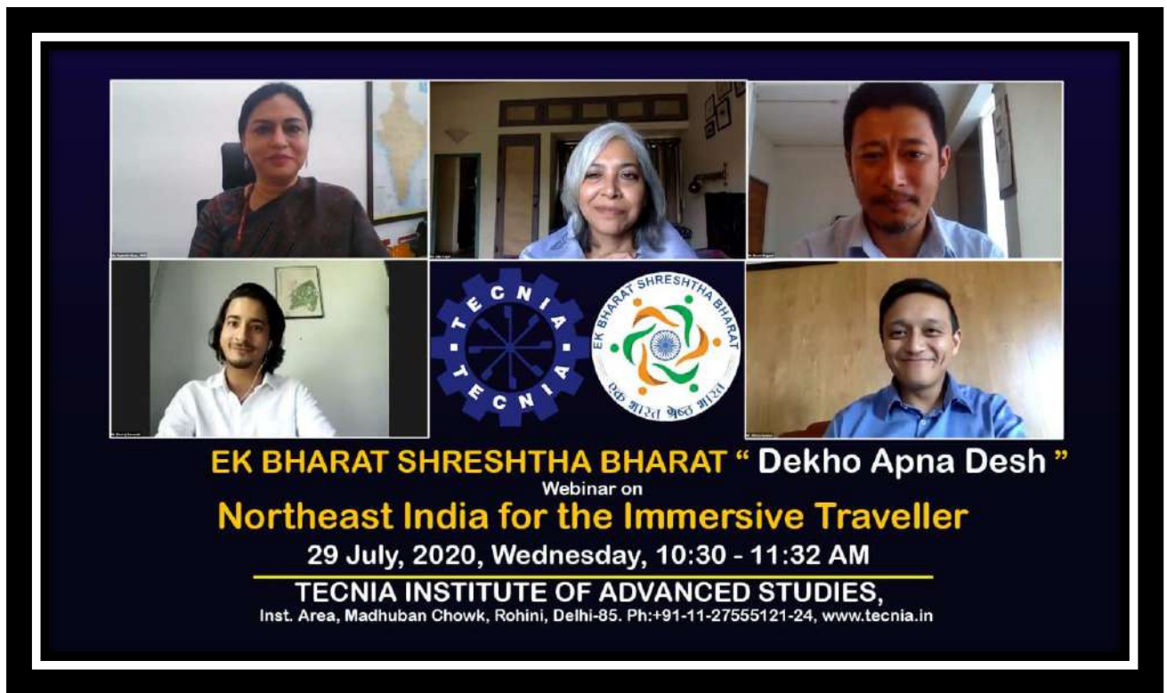
Resource Persons of “Dekho Apna Desh” Webinar