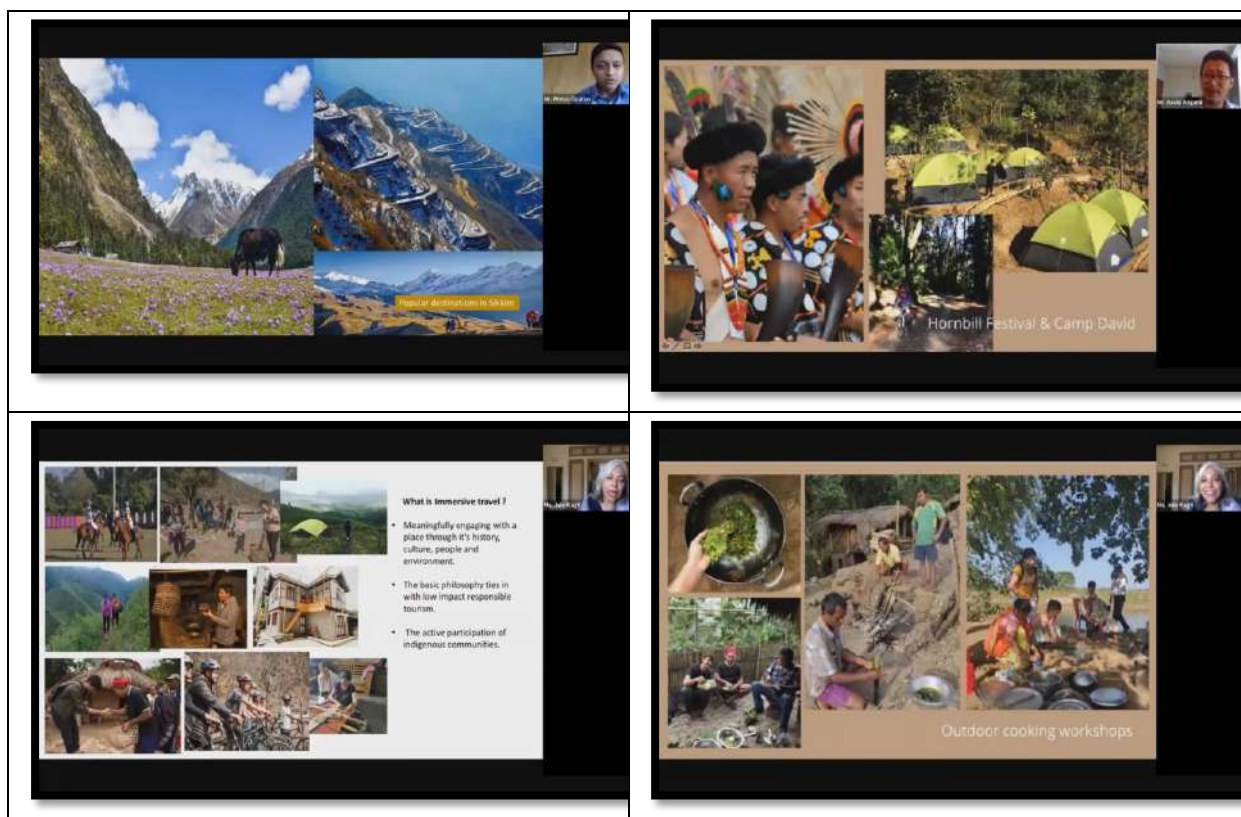
Locations/Sites/Tourist Spots along-with Customs/Traditions of Sikkim

Accordingly, students from all the four programmes like MBA, BBA, BA(JMC) and BCA participated in above-mentioned “Dekho Apna Desh Webinar” and understood the various dimension of heritage and culture, customs and traditions of the pairing state Sikkim.