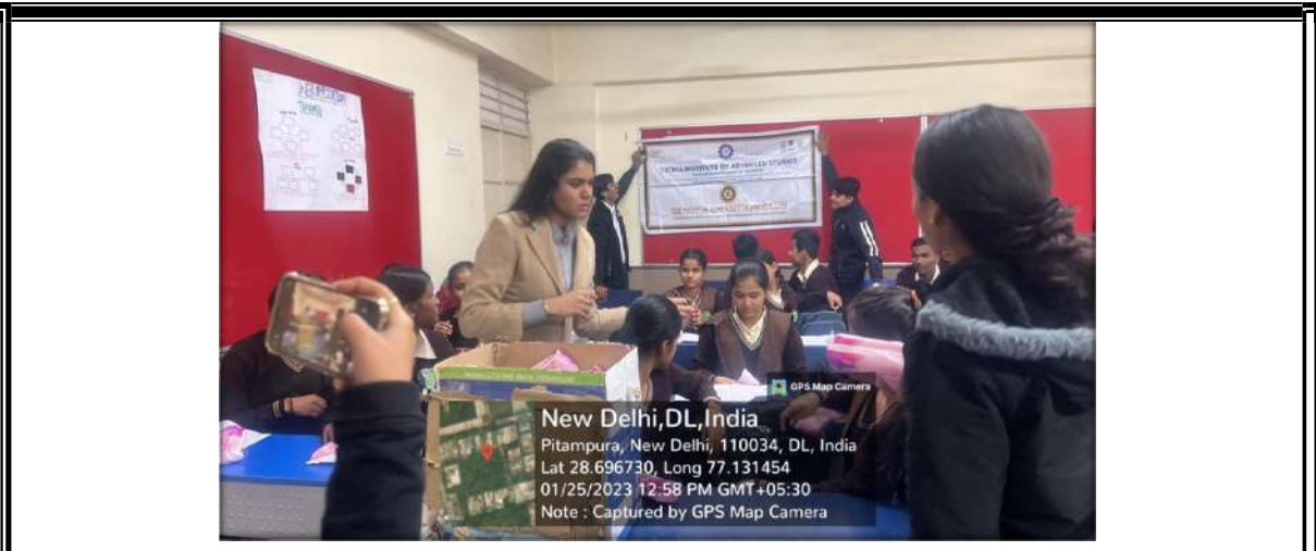
Discussion on Women Hygiene