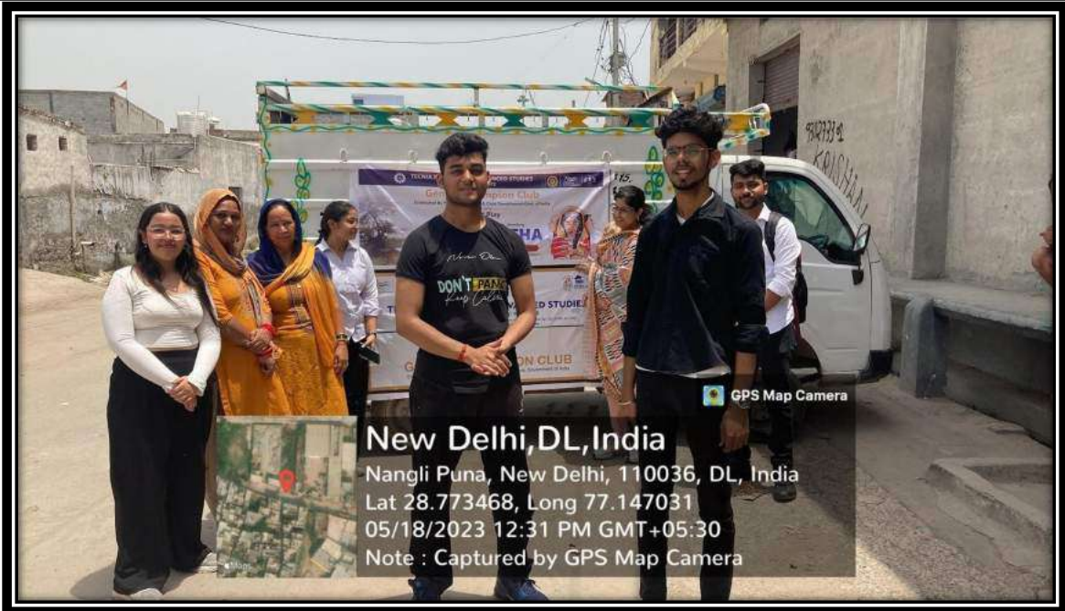
Students raising awareness on dowry system in India