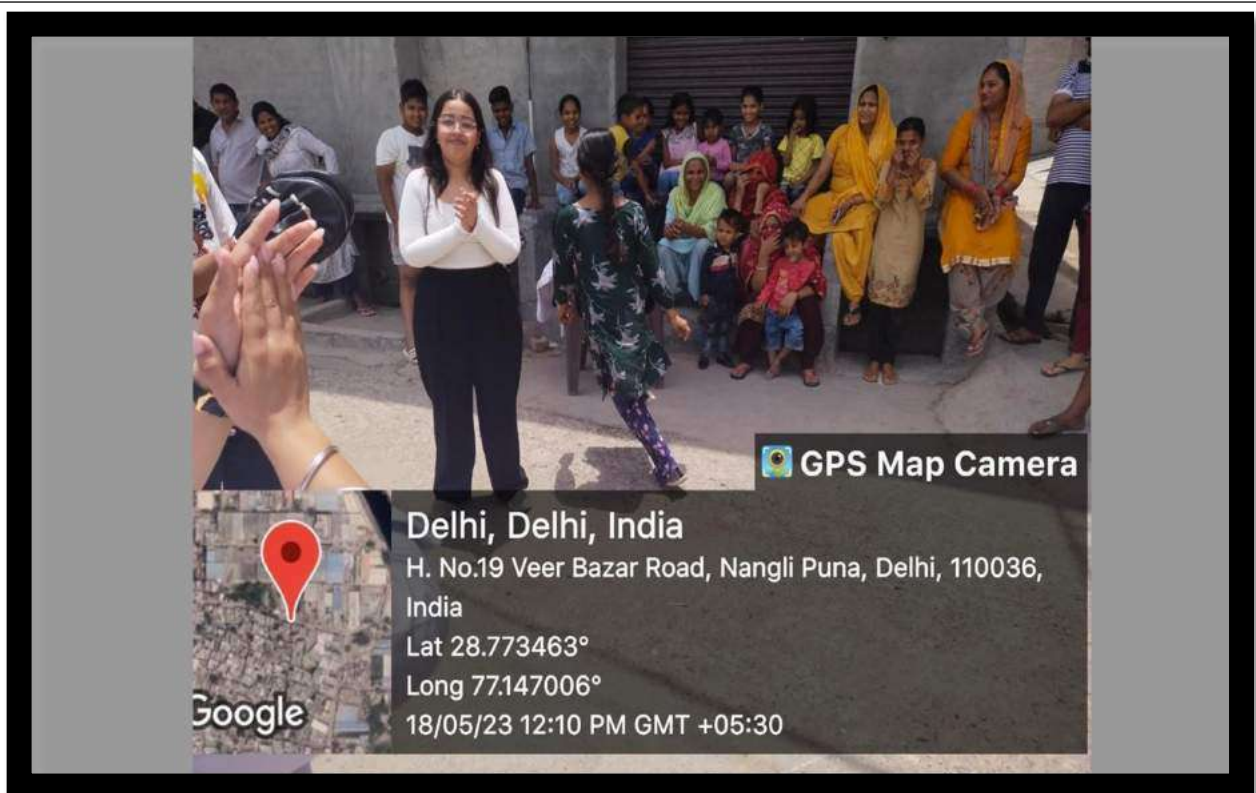
TIAS students while performing street play