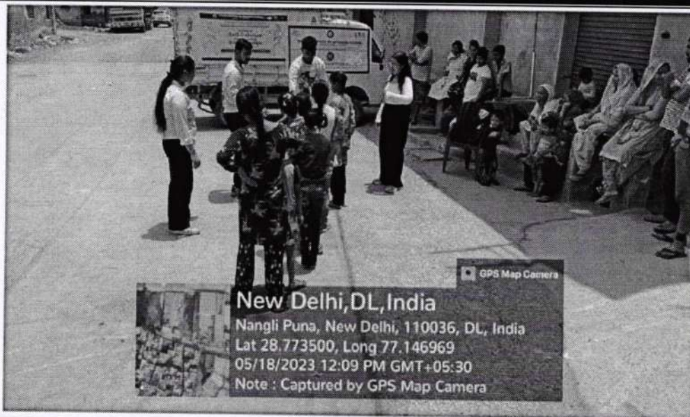
Rural Girls Practicing Defense Techniques

The Outreach Activity for the Training on Self-Defence is a key initiative aimed at empowering and safeguarding the safety of community people. This outreach task, which emphasized personal safety and self-defense, functioned as a bridge between the Gender Champion Club and the locals of Nangli Puna hamlet. By actively engaging the community, the students were able to raise awareness of the subject matter and promote participation from individuals of all backgrounds and ages.