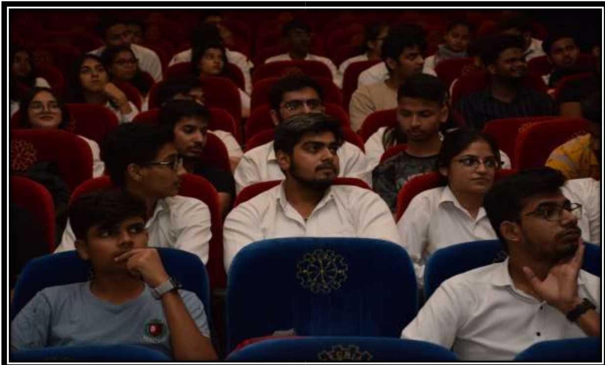
Students Participate in workshop on EAP by MSME