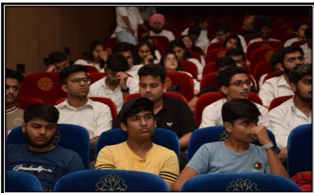
Students Participate in workshop on EAP by MSME