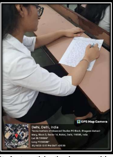
Student participating in competition

On October 30, 2023, an article writing competition was held on the theme of the media's role in women's empowerment. The event's goal was to ensure economic growth while also raising awareness and educating the audience about the harmful implications of this social issue that is pervasive in our society.